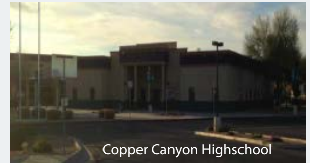
Copper Canyon High School